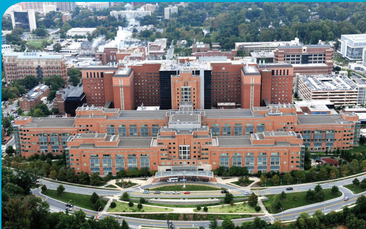
NIAID is located just outside of Washington, D.C., on the campus of the National Institutes of Health (NIH) in Bethesda, Maryland.

Clinical trials are research studies in which people help doctors find ways to improve health. Each study seeks to answer scientific questions and to find better ways to prevent, diagnose, or treat disease. Volunteering to participate in a research study can help people play a more active role in their own health care, gain access to new research treatments before they are widely available, and help others by contributing to medical research.